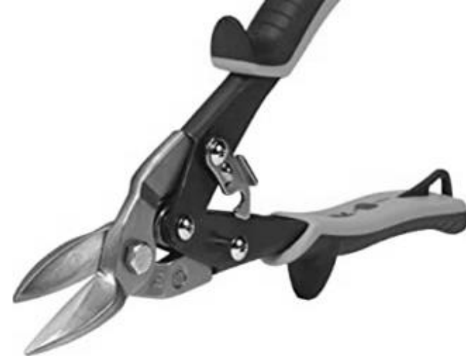
Straight Cut, Yellow Handle