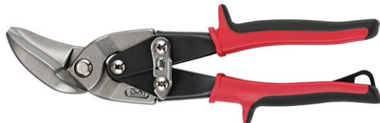
Offset Left Cut, Red Handle