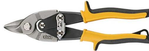
Bulldog, Yellow Handle