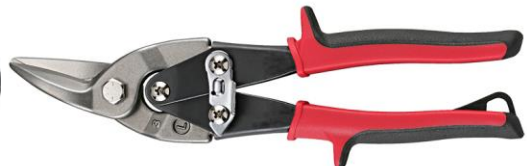
Left Cut, Red Handle