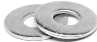
5/16" USS Flat Washer