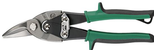
Right Cut, Green Handle