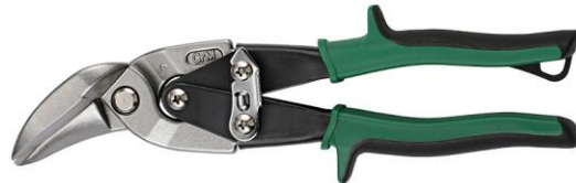
Offset Right, Green Handle